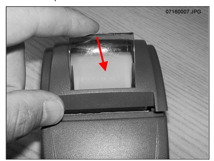
Figure 3: Unlock paper compartment

Pull the lever up until the lid is released. Do not use excessive force.