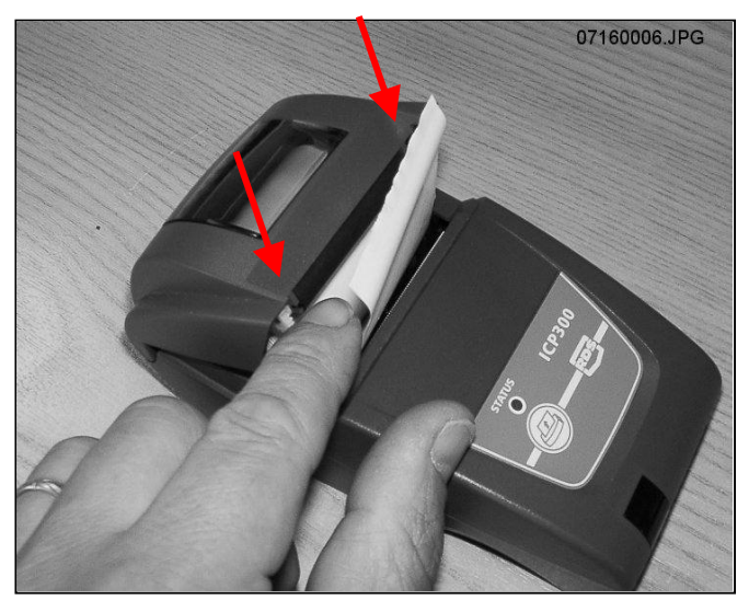
Figure 4: Lock paper compartment

Replace the roll and press the lid at each side until it clicks shut.